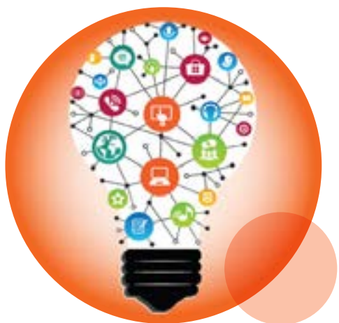
Technology Fair p. 6