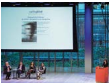
The 2018 Loraine Halis Lecture Panel on stage at TheTimesCenter.