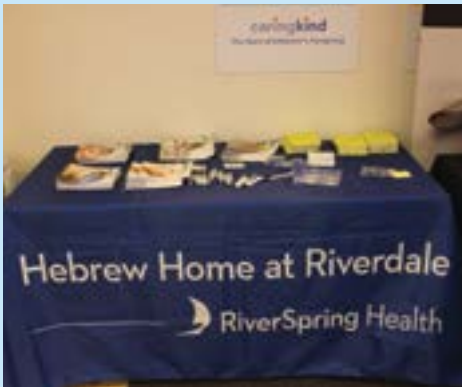
RiverSpring Health's Balance App