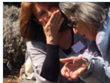
Smelling herbs along the garden path.

As the pool of cultural partners grows to include botanic gardens, performance and visual arts organizations, and history museums, connect2culture hopes that through understanding the effects of dementia on the whole community – friends, neighbors, family – the sensitivity to their needs for sensory and social stimulation will grow.