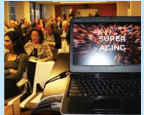
Super Aging with technology