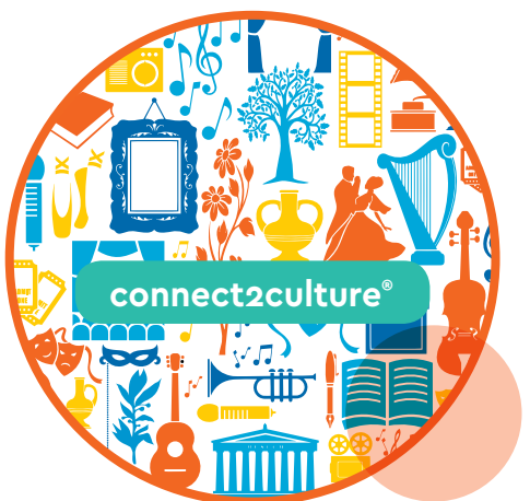
Feature p. 9