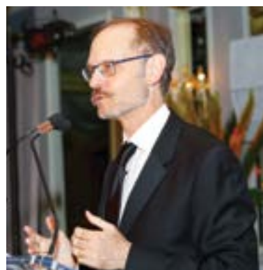
David Hyde Pierce makes opening remarks.