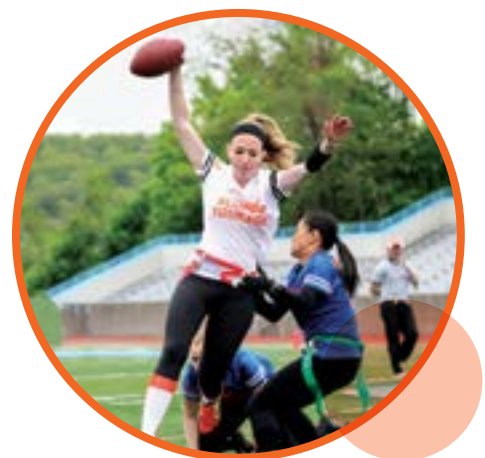
Athletes To End Alzheimer's p. 20