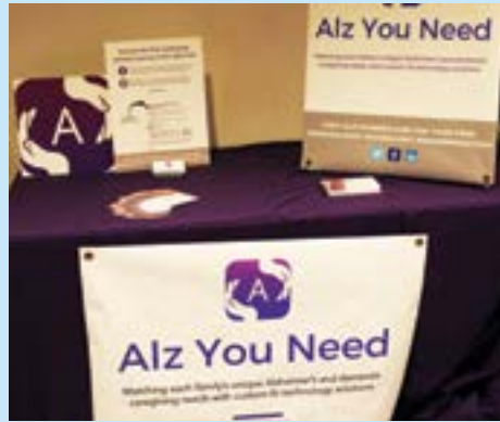
Alz You Need