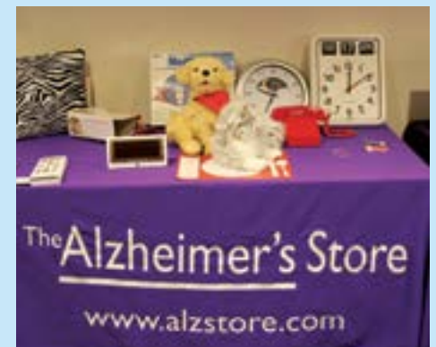
The Alzheimer's Store