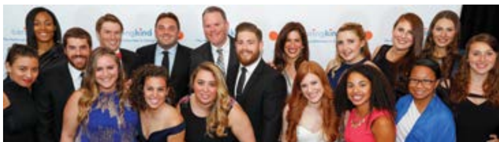
Members of the 2018 TackleALZ NYC team which was honored with the Young Leadership Award.