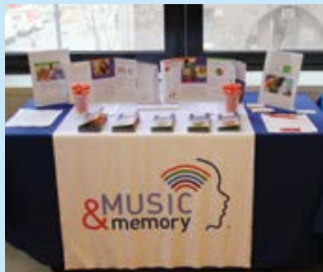
Music & Memory