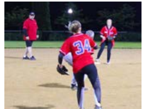
Team Hebrew Home at Riverdale in action.